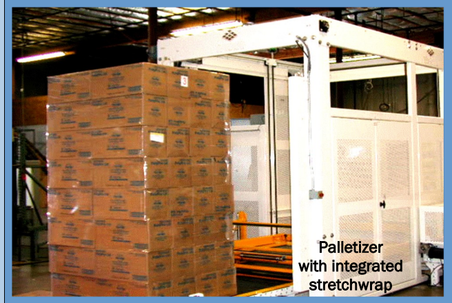
Palletizer with integrated stretchwrap

There is often an age-old battle between spending your time defining what needs to be done, and actually getting something done. Finding the proper balance is a key to an effective solution for your Process or Packaging Line needs. We fully realize that you need to work within requirements that involve words like "justification", "capacity", "profitability", "budget", and other organizational words of wisdom. Making sense of all those wise thoughts, getting everyone agreeing on goals, and then figuring out how to reach them, can involve such an effort that it might seem you would rather just skip to playing hunches. Picking the right equipment for a line should definitely not simply be playing a hunch. Fortunately, once you know some parameters to the process, we can help as a part of the team that defines the equipment to get the job done.